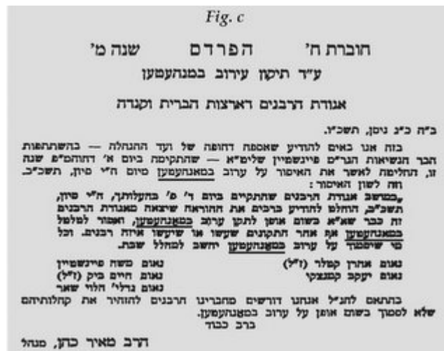
1962 Agudath ha-Rabbanim Proclamation Against Establishment of Manhattan Eruv